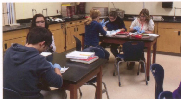
*Hard at Work* The Chemistry class is hard at work while making bouncy balls.

"If we knew what it was we were doing, it would not be called research, would it?" - Albert Einstein