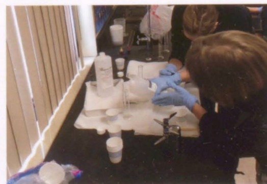
*Safety First* The seniors working hard to make sure the lab goes as planned and nobody gets hurt!

"If we knew what it was we were doing, it would not be called research, would it?" - Albert Einstein